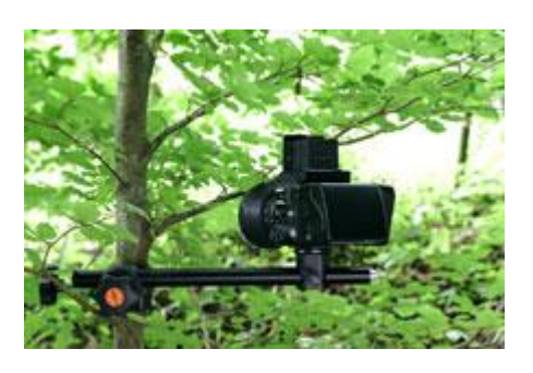
The camera can be mounted almost everywhere, with help of COMBITUBE, the screw-clamp COGAE and the camera plate CESTU.