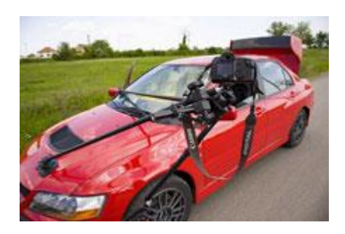
Shooting of a car in motion: COMBITUBE elements, sucking cups, mini tripod ASNIO and ball head SUPERBALL M-2

Beneath the traditional studio stands and tripods, FOBA offers a wide range of supports to fix cameras easily and securely in any kind of setting, even in those difficult to access.